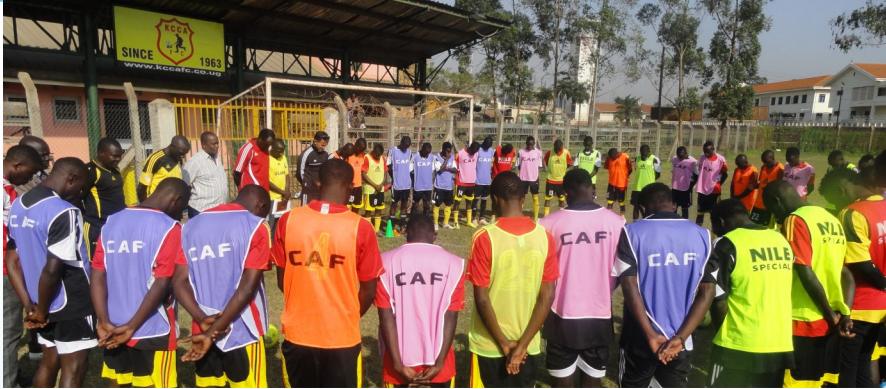
A prayer moment for U-23 players before starting training at Phillip Omondi stadium, Lugogo