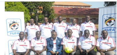
Instructors of the FAMACO I