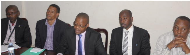
FUFA President (M) breaking the news to the media-acquisition of FUFA FM 102.1