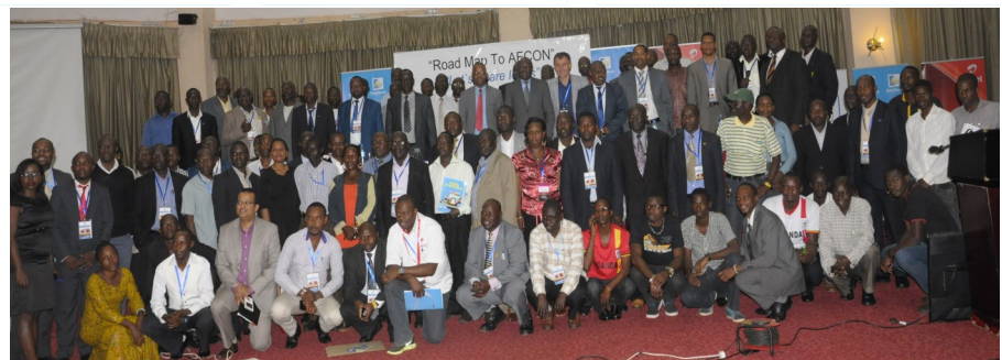
Participants of the 2015 FUFA Symposium