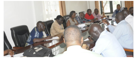
FUFA Executive meeting held on 25th January 2015 at FUFA House, Mengo