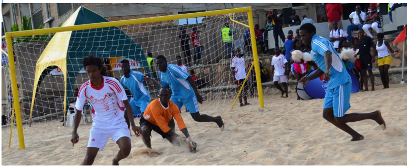
Revita in action during the Pepsi Beach Soccer League at Lido