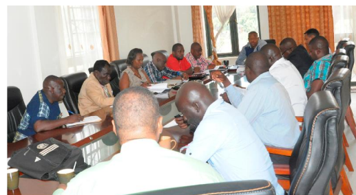
FUFA Executive Meeting in the Board room at FUFA House.