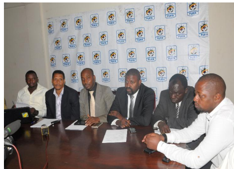
FuFA top brass during the weekly press conference