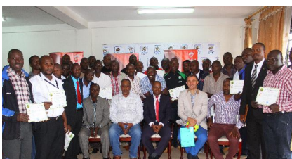
Successful participants of the CAF C coaching course with FUFA President and Cranes coach shortly after being presented with their licenses and certificates.