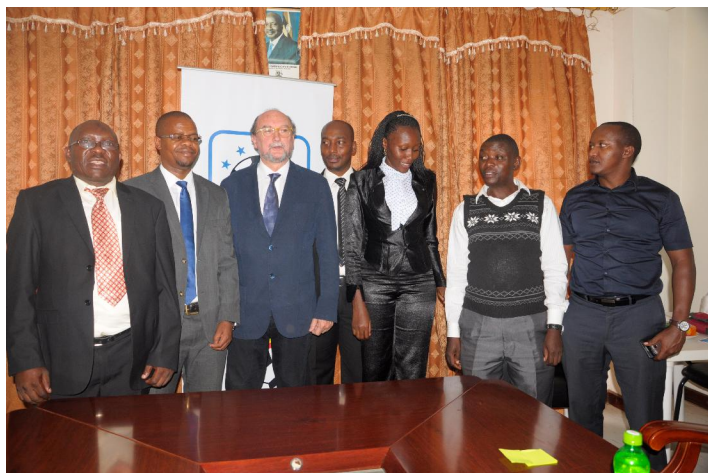
AIPS and FUFA Presidents, USPA Executive in a photo moment at FUFA House Board room.