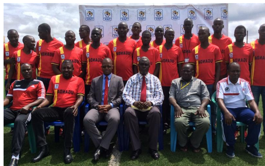
Participants at the opening ceremony of the FUFA club management course

'As FUFA we decided to bring this course at a free cost to all secretaries of Super and Big league clubs but some have