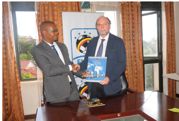
FUFA President receives a book detailing the AIPS history since 1924.