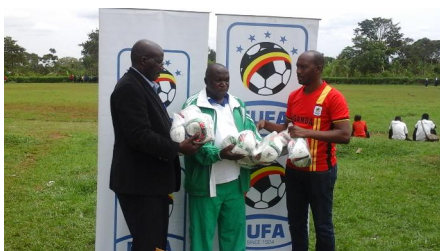
FUFA supports the Uganda Muslim Education Association (UMEA) Games in Kasawo by donating 20 quality balls