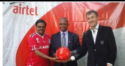
Airtel sign a 4 year deal with FUFA.