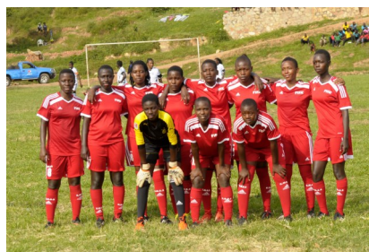
Kawempe Muslim Senior Secondary FC