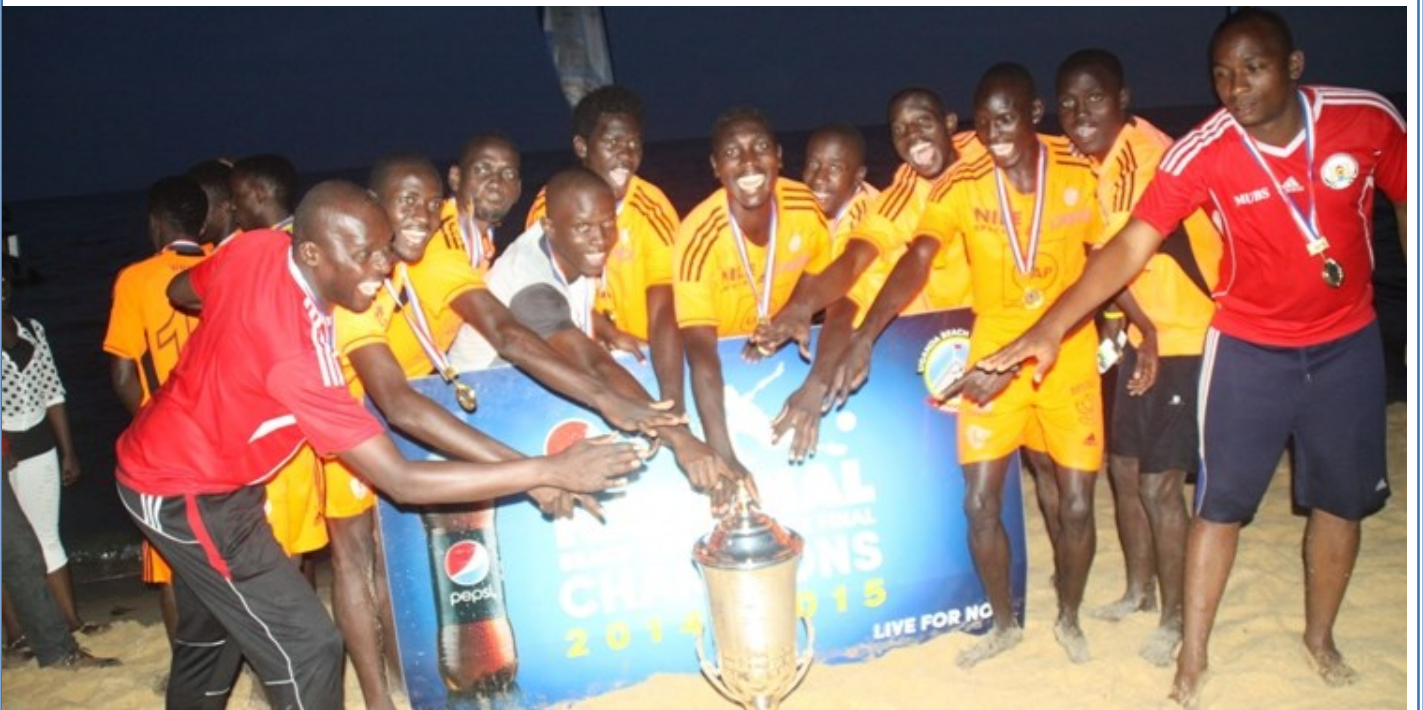
MUBS—winners of the PEPSI National Beach Soccer League 2014/15