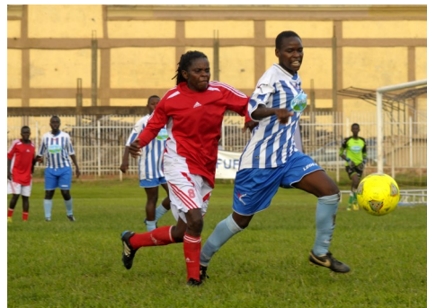
Action in the Kawempe vs Buikwe final