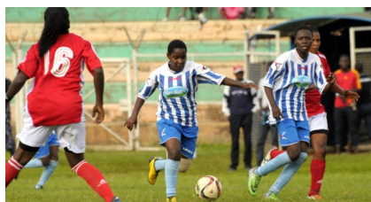
Action in the Kawempe vs Buikwe final