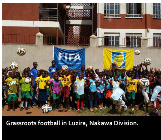
Grassroots football in Luzira, Nakawa Division.

Kampala region was the first beneficial with the other regions yet to be tackled. The programme launch was at Old Kampala play ground last year before the initial community outreach at Rubaga division.