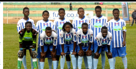
Kawempe Muslim S.S FC