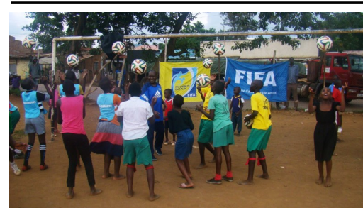
Grassroots football in Kawempe division