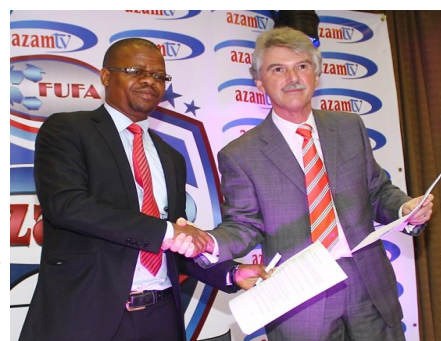
Azam TV are sponsors of the AUPL.