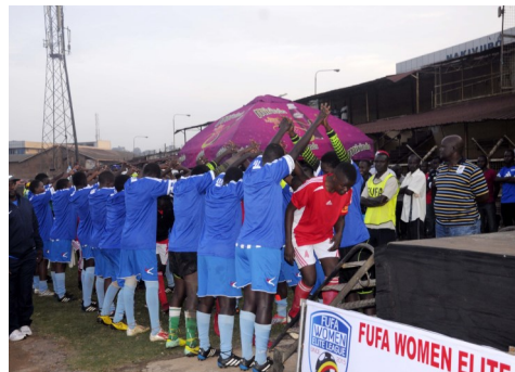
Respect: Winners Kawempe build a guard of honor for the finalists Buikwe in the FWEL.