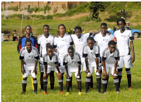
Buikwe She Red Stars FC - Runners Up