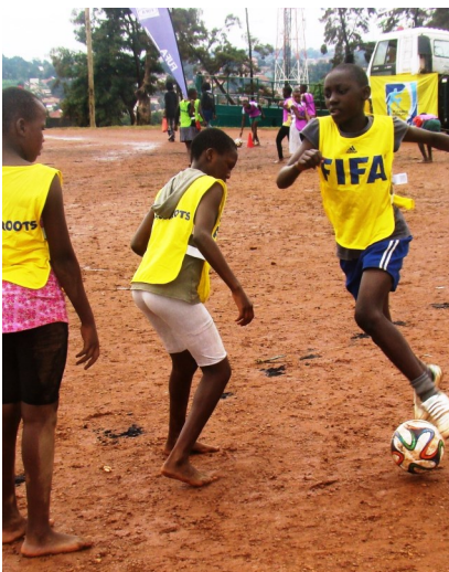
Young girls enjoying Grassroots football in Nabweru, Kawempe Division.