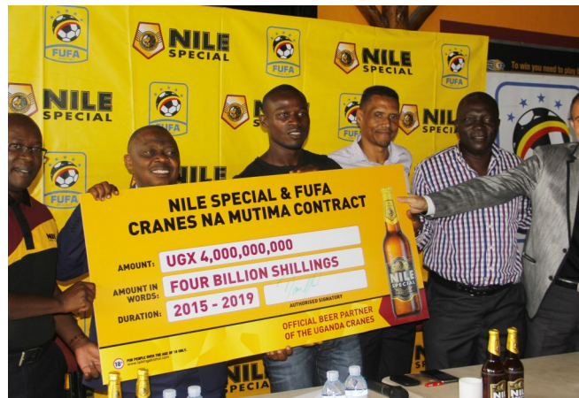
Nile Special-FUFA UGX 4 Billion partnership

sponsorship deal that was worth UgX 1.2 Billion for three years, to October, 2015.