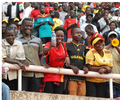
Fans who cheered on the Cranes as they beat Botswana 2:0 at Namboole.