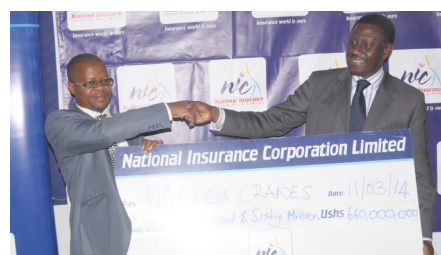
NIC — Insuring the Uganda Cranes.