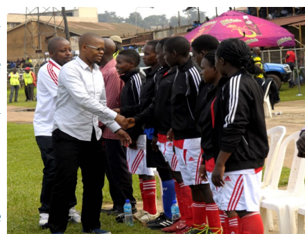
FUFA President shaking hands with Buikwe She Red Stars bench.