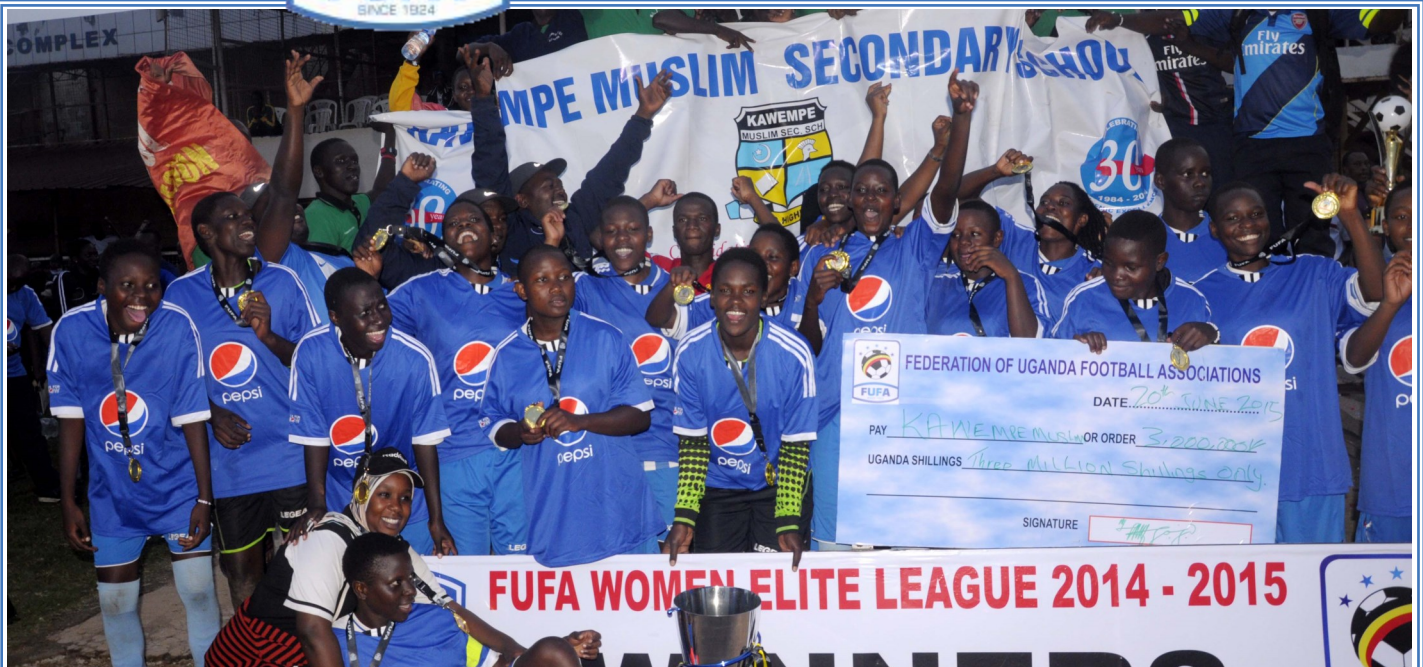
Kawempe Muslim S.S FC winners of the FUFA Women Elite League 2014/15