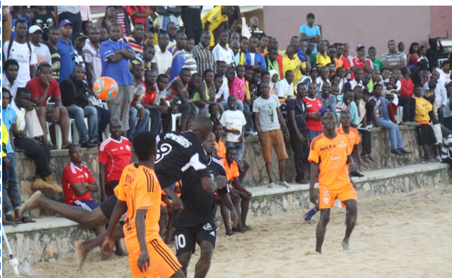
MUBS (orange) vs Stormers in action on the final match of the season.

In the third place play off, Nkumba Select overcame a hard fighting Real Galaticals' outfit 5-3 in another nail