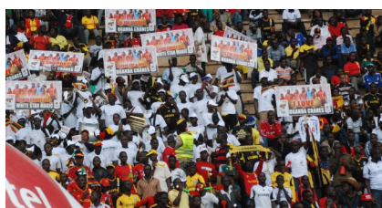
Creative fans with placards carrying messages in support of Uganda Cranes vs Botswana. They were sponsored by BIDCO