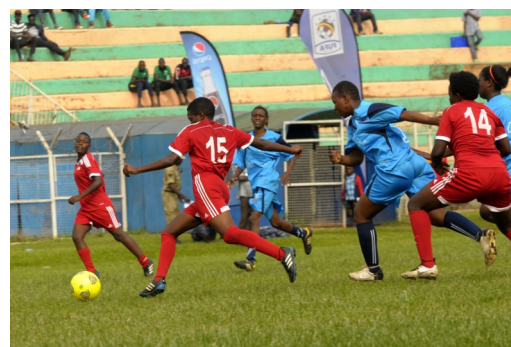
Kawempe (red) vs She Corporates at Nakivubo Stadium semi final match