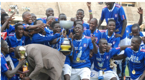
Sc Villa beats KCC 3-0 to lift the FUFA Uganda

Sports Club Villa overcame Kampala City Council