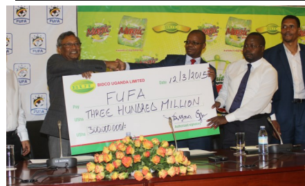
BIDCO have a 3 year deal with FUFA.