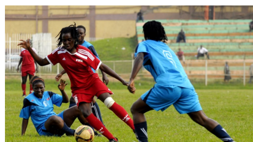
SKILLS: Kawempe (red) vs She Corporates at Nakivubo Stadium semi final match

2015 FUFA WOMEN ELITE LEAGUE CHAMPIONS KAWEMPE MUSLIM S.S FC