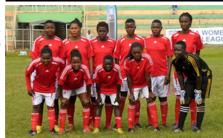
Buikwe She Red Stars FC