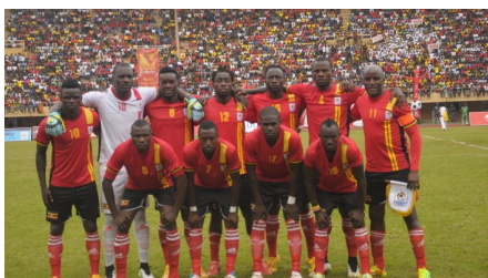
Uganda Cranes starting XI against Botswana