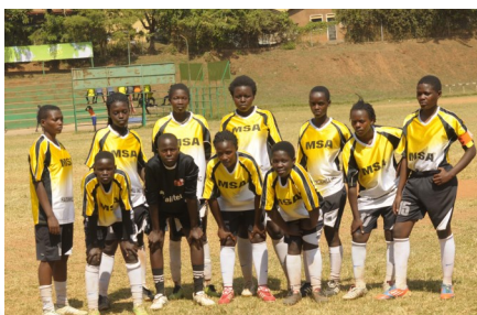
Western United Ladies