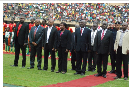
Dignitaries before kick off Uganda vs Botswana