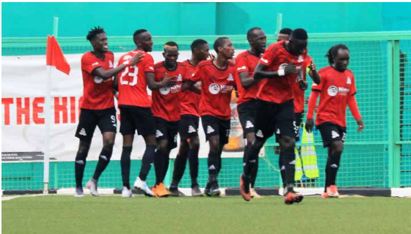
Vipers SC were declared StarTimes Uganda Premier League champions 2019-2020 season

The deadly COVID-19 pandemic spread by the highly contagious coronavirus stained life for the better of 2020.