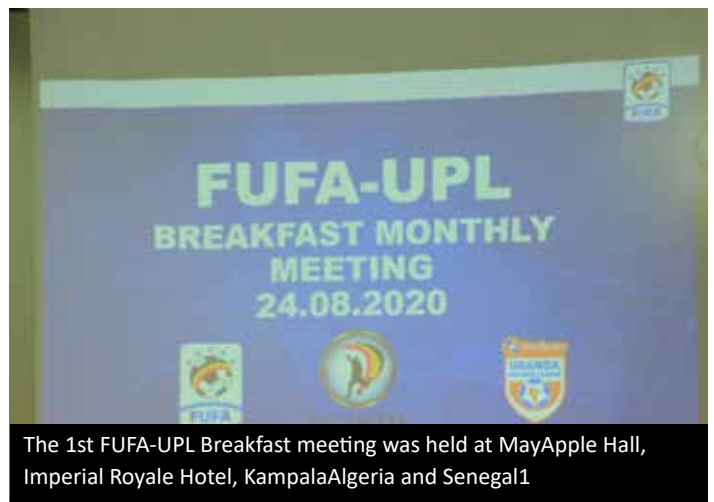
The 1st FUFA-UPL Breakfast meeting was held at MayApple Hall, Imperial Royale Hotel, Kampala

As earlier planned, the Federation of Uganda Football Associations (FUFA) fulfilled the promise of hosting monthly break-fast meetings with the Uganda Premier League members. The inaugural meeting was held on Monday, August 24, 2020 at May Apple Hall, Imperial Royale Hotel in Kampala.