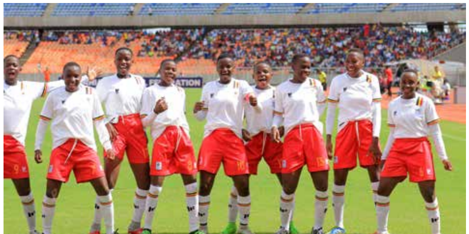
Uganda U17 Girls in the moods to destroy Cameroon